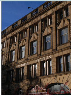
Victoria Station, once one of the largest passenger railway stations in the world. The Edwardian frontage retains the ornate iron and glass canopy bearing the names of original destinations served by the Lancashire & Yorkshire Railway.