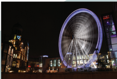
Right: Exchange Square, the location of the Manchester Wheel which despite its size is not a permanent structure. It is however a wonderful subject for photography, especially after dark.