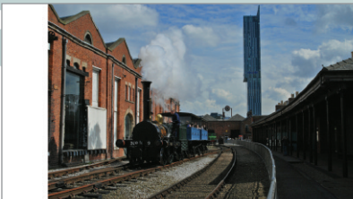
The area also boasts one of the world's oldest railway stations, Liverpool Road Station. This now forms part of the Manchester Museum of Science and Industry where the workshops have constructed 'Planet', a fully operational replica of the first locomotive on the Liverpool to Manchester line.