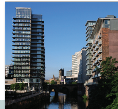
Above right: The River Irwell is the natural boundary with the adjacent city, Salford.