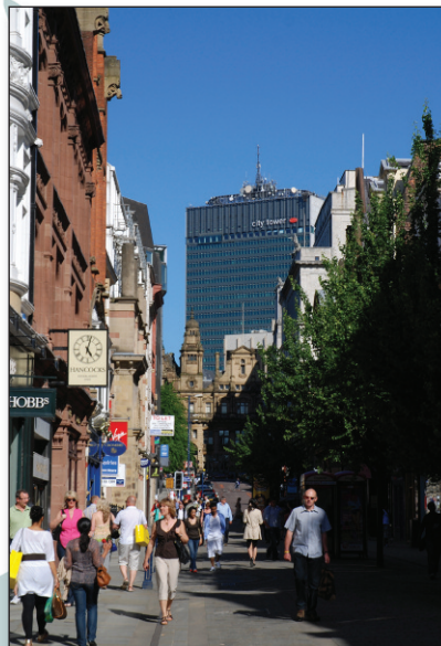
Above: King Street is lined with some of Manchester's most exclusive shops and leads to the city's financial district with its imposing former banking buildings.