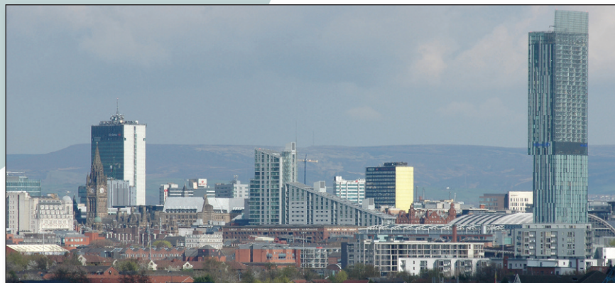
Below: The Manchester skyline. A telephoto shot taken from the viewing gallery of the Imperial War Museum at Salford Quays.