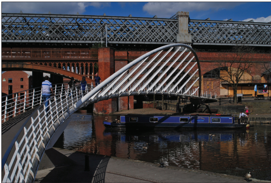
Above: In the midst of all the Victorian splendour is the 'new' Merchants Bridge. This tubular steel structure was erected in 1996.